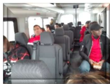
Photo left: The bus is used to pick up for all services, four each week. In the photo are several people who have come to Iceland seeking asylum. Many will be sent away. It is an honor to minister to them as they are here in Iceland. That outreach is a very challenging ministry. Many do not speak English. We have people from over 20 different countries